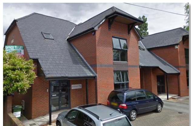
Visitor parking is at the rear of the building. Our office is shown here in the left-hand part of the building